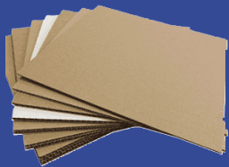
Flattened Corrugated Boxes