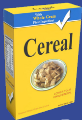
Paperboard and Cartons