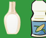
Salad Dressing & Cooking Oil Bottles