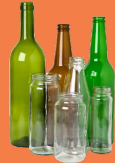
Bottles and Jars